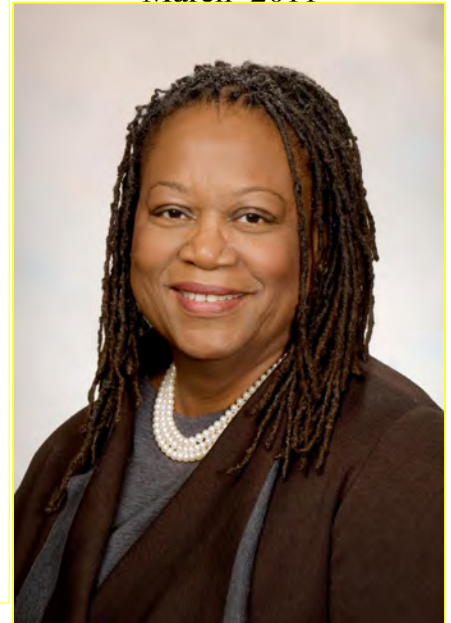
Senator Mamie E. Locke

The 2011 legislative session adjourned one day past schedule as last minute flurries with the budget were completed. Unlike 2010, there was not a budget shortfall, but unanticipated funds to be used for various services. The FY2010 budget reflects the commitment of Senate Democrats to addressing the needs of Virginia’s families through bipartisan solutions. I applaud the Senate conferees and the Senate Finance staff on their diligence and hard work in making the outcome of this process beneficial to citizens of the Commonwealth. I have outlined below highlights from the budget. The session adjourned and a special session was immediately called to address redistricting. We are currently in recess until April 4. Please feel free to contact me with questions or issues of concern. Through dialogue and a commitment to good government, we can make the Commonwealth of Virginia, and the 2nd Senatorial District, the best.