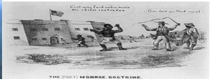
Slaves escape to the fort after Gen. Butler's decree that all slaves behind Union lines would be protected. The policy was called the "Fort Monroe Doctrine" alluding to Butler's headquarters at the Fort